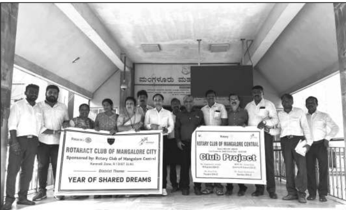
Board Meeting of our Club for October