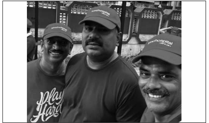
Celebration of Gandhi Jayanthi by our Club