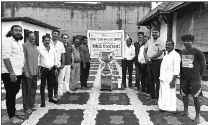
Donation of Water Purification System by our Club to Koteda Babbu Swamy Daivastana Urwastores