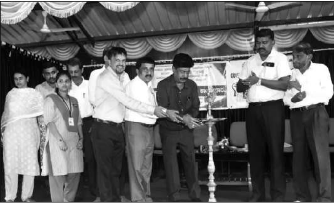
Media Information Workshop conducted by our Club