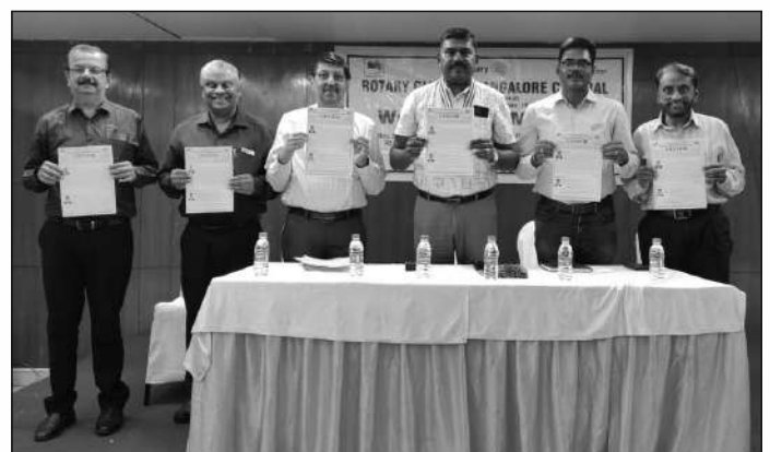
Release of Centor by the Hosts of the Family Dinner Meeting of the Club for September.