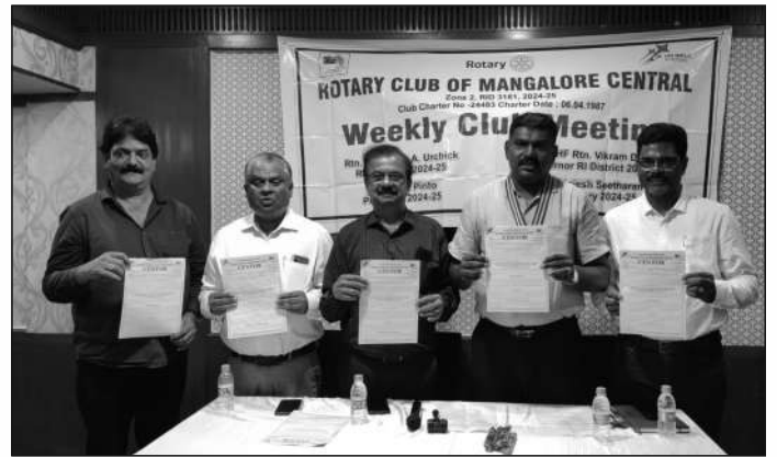
The Annual General Body Meeting of the Rotary Mangalore Central Foundation